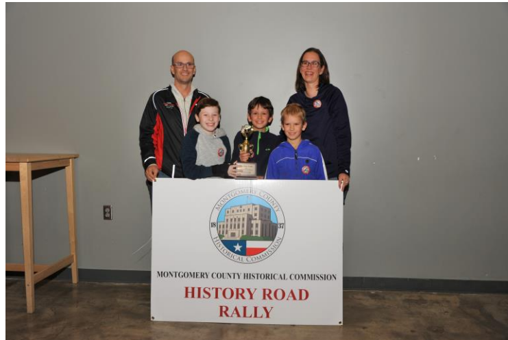
First place winners of the History Road Rally

winning teams received trophies and $25 gift cards courtesy of our sponsor Gullo Ford, Gullo Toyota and Gullo Mazda automobile dealerships of Conroe.