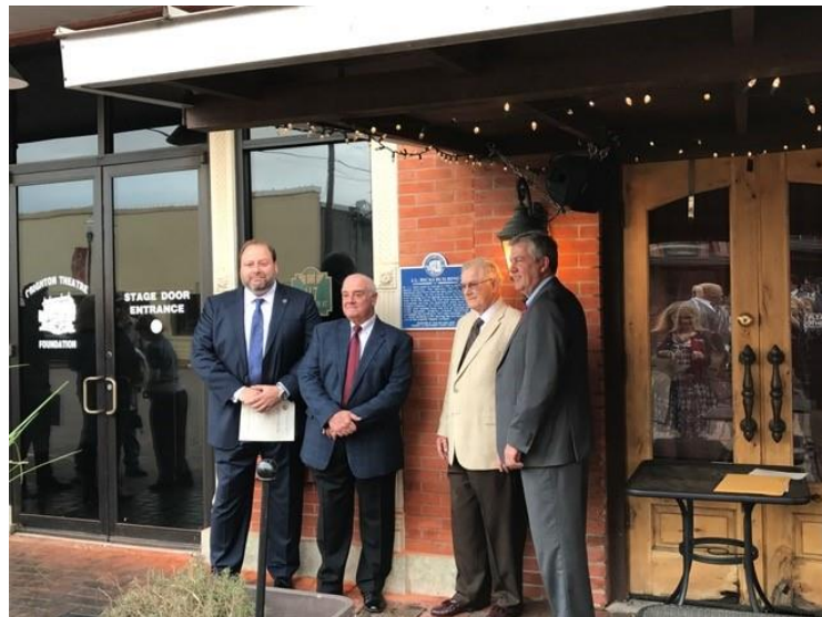
City and County Officials at J L Hicks Building marker

On June 3, the fifth county historical marker was dedicated to the Grogan-Cochran House, which is the home of the Heritage Museum of Montgomery County. County