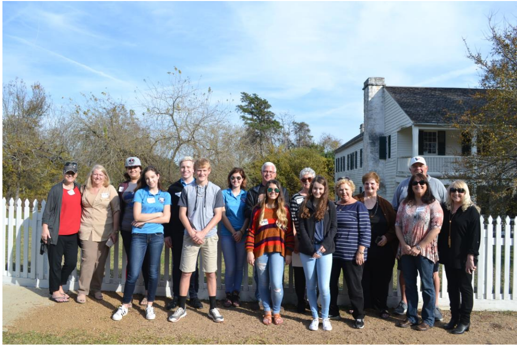
2017-2018 Youth Advisory Board with Sponsors at Fanthorpe Inn in Anderson