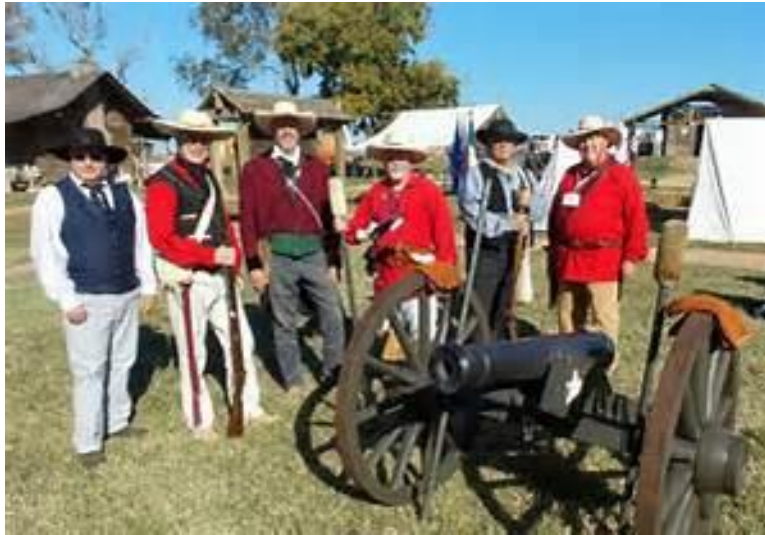
Sons of the Texas Republic at Texian Heritage Festival