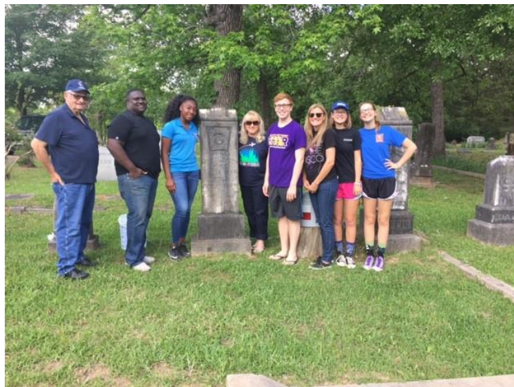
2016-2017 Youth Advisory Board at Oakwood Cemetery