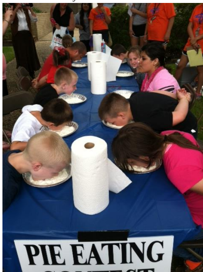
Pie Eating Contest for the kids