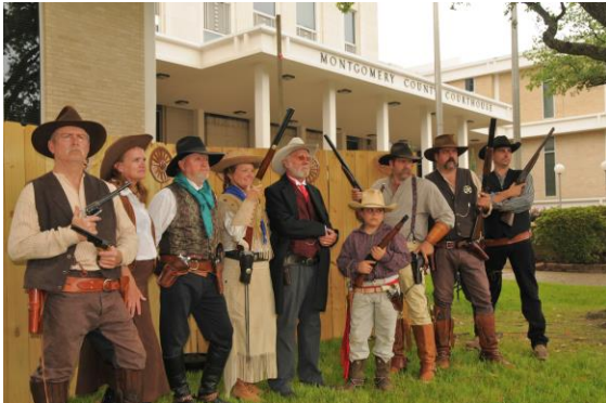
Wolf Creek Pistoleros